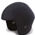
UPA00001 WINTER PADDING