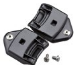
WAC00003 ADAPTER WITH BAYONET