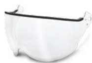
VW100002 VISOR V2