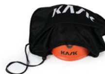
UAC00002 HELMET BAG