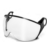
WVI00007 ZEN VISOR