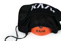
WAC00026 HELMET BAG