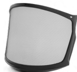
WVI0009/10 ZEN MESH VISOR