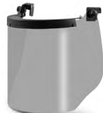
WVI00016 / WVI00017 ARC FLASH