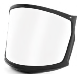
WVI00008 ZEN FF VISOR